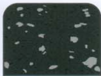
425 Lt. Gray