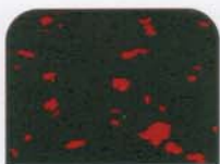
412 Lipstick Red