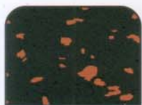
409 Terra Cota Red

We can provide a wide variety of color combinations and options allowing the coordination of your flooring with equipment, furnishings and overall decorative design.